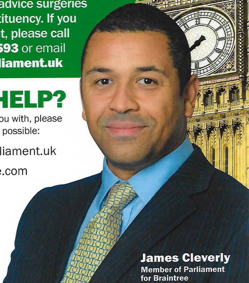
James Cleverly Member of Parliament for Braintree